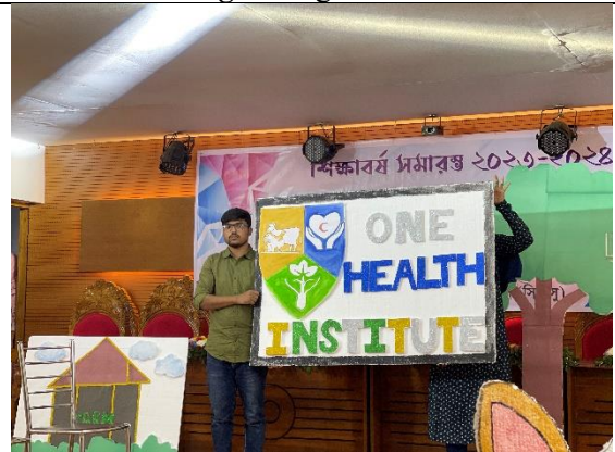
Fig 9: Stage drama presenting OHI