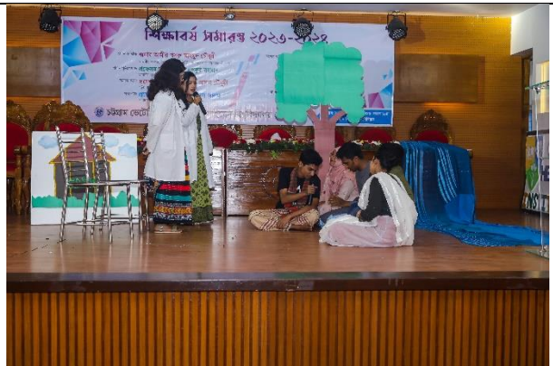
Fig 8: Stage drama, climax scene