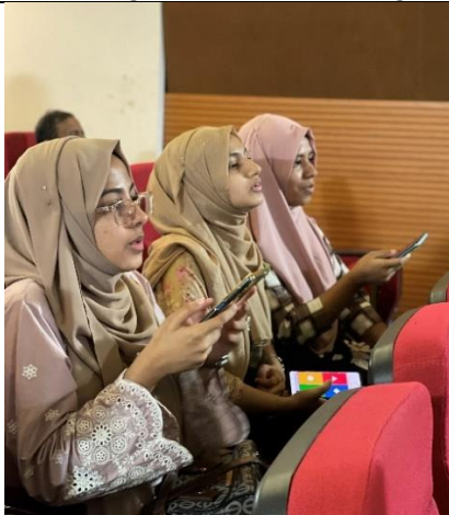
Fig 19: Intense moment during Kahoot game among participants