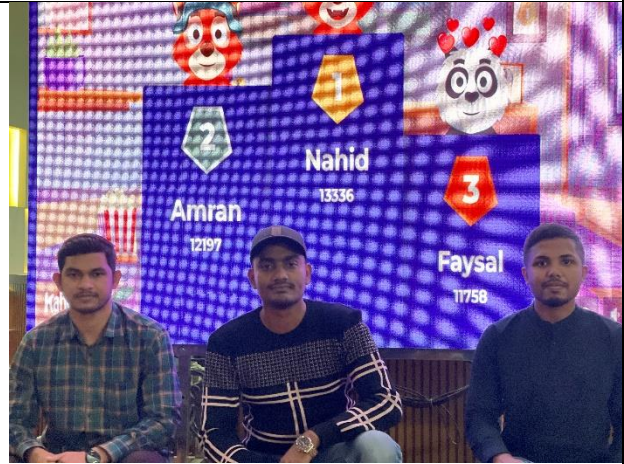
Fig 20: The winners of the quiz competition