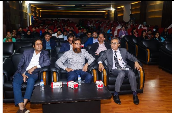
Fig 2: From left, Asst Prof, CMC, Director of Student Welfare, Director of OHI, Director of Research & Extension in the back