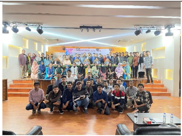
Fig 26: Group Photo