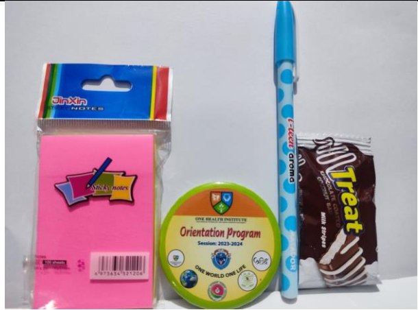
Fig 6: Token of appreciation for the presence of the freshers'