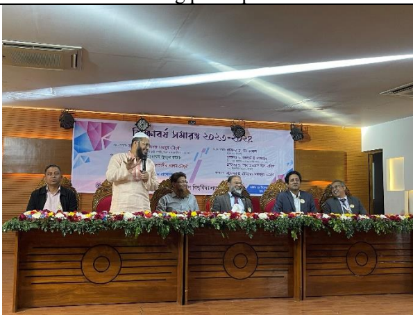
Fig 21: The honourable VC and guests of the event