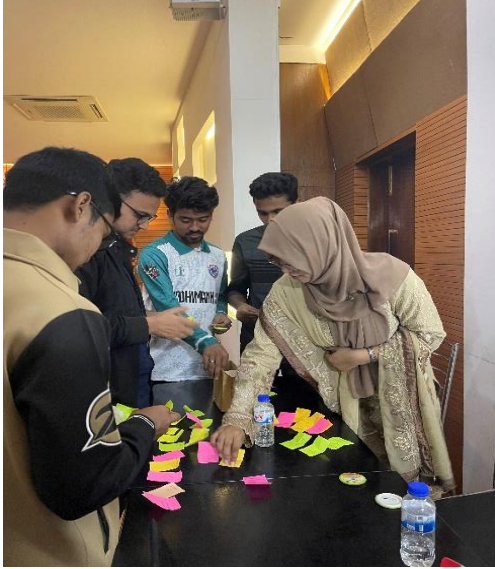
Fig 17: Counting the votes for the organisations