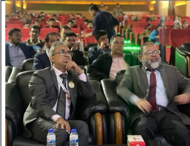
Fig 1: Honorable VC, Director of OHI, Director of Research & Extension