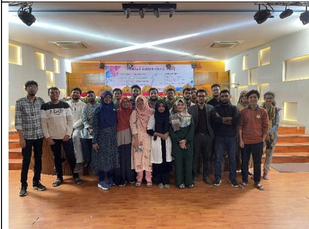
Fig 25: The volunteers of the event