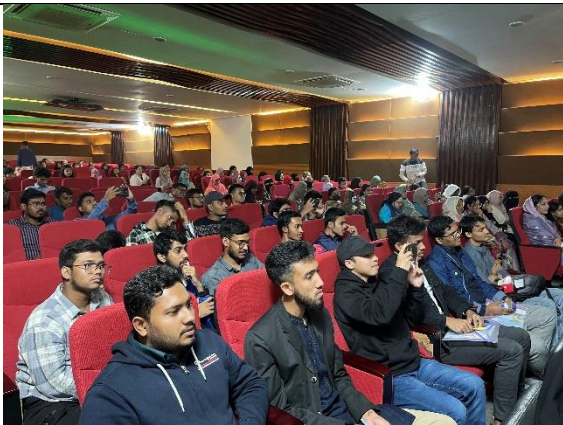
Fig 3: The Freshers'