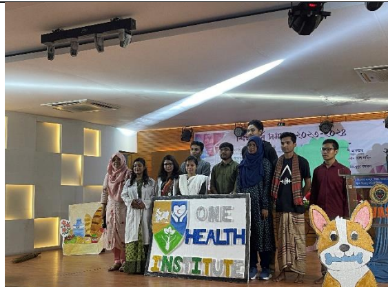
Fig 10: Drama team