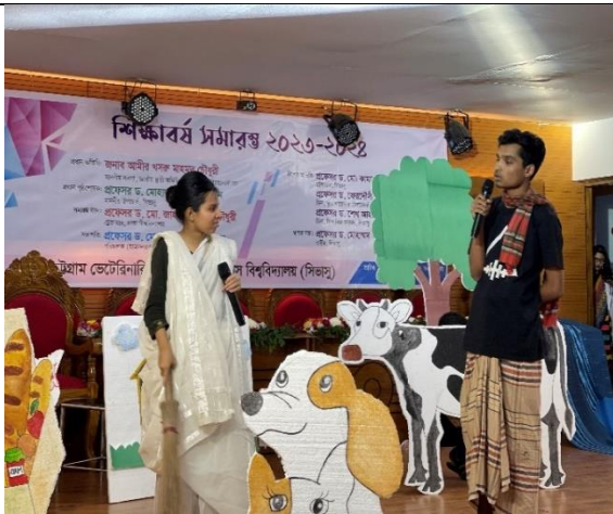
Fig 7: Stage drama